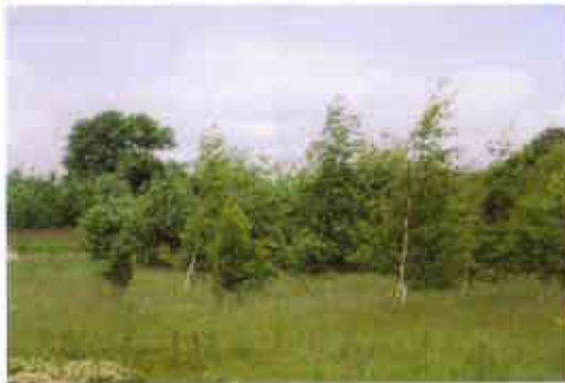
The Birchgrove Grove

Birchgrove is a self-help, user led support organisation for people affected by the issues of Haemophilia and HIV and HIV / HCV coinfection.