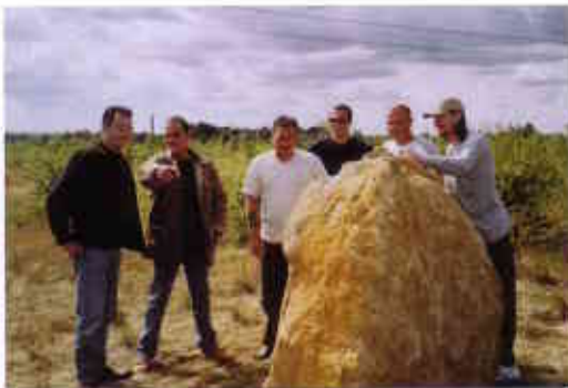
Birchgrove readers on the day of the stone installation