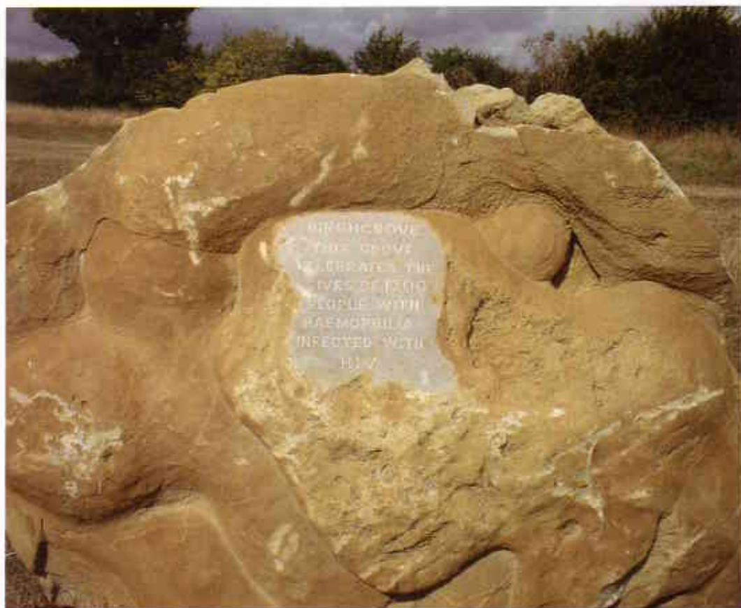
PICTURE OF STONE WITH ENGRAVED WORDS

This grove of trees will not only be a memorial to those who have sadly died, but will also show the resilience and strength of those who are still affected and living with HIV/AIDS.